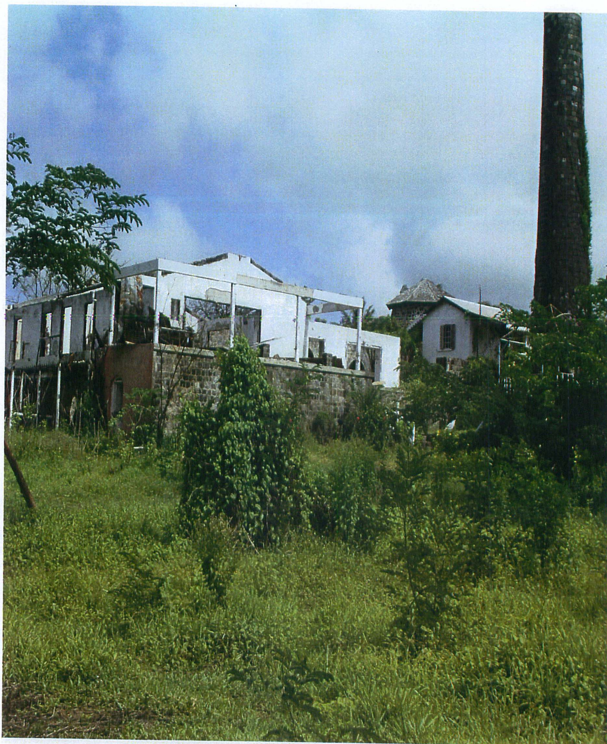
Photo P37 : View of the main Great House building from the croquet lawn.