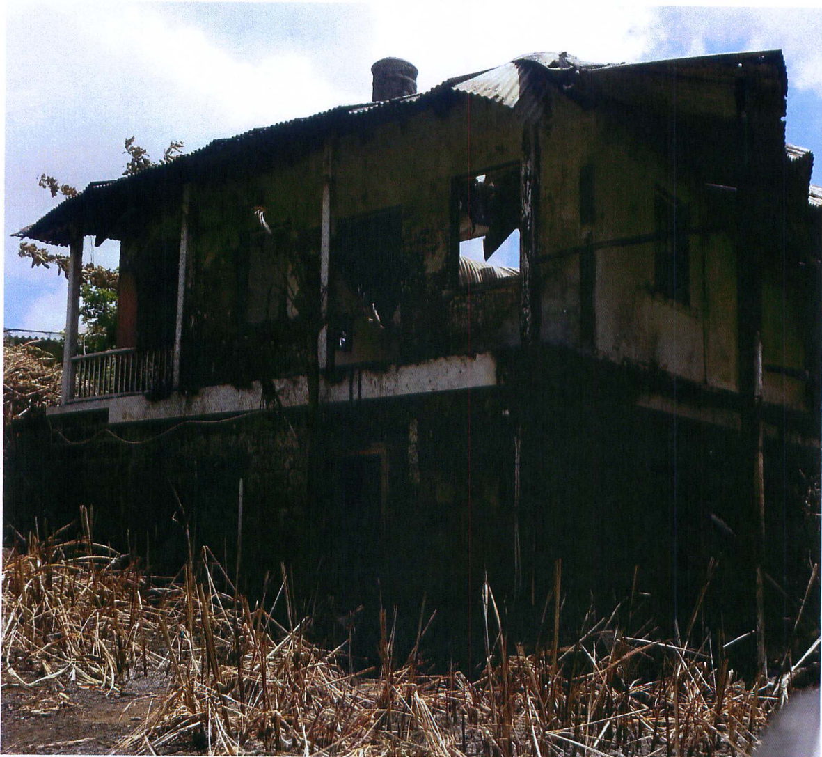
Photo P31 : North East elevation of the Main Great House building.

Rawlins Plantation Inn after seizure by FCIB, and after the subsequent fire of 8 th May 2015.