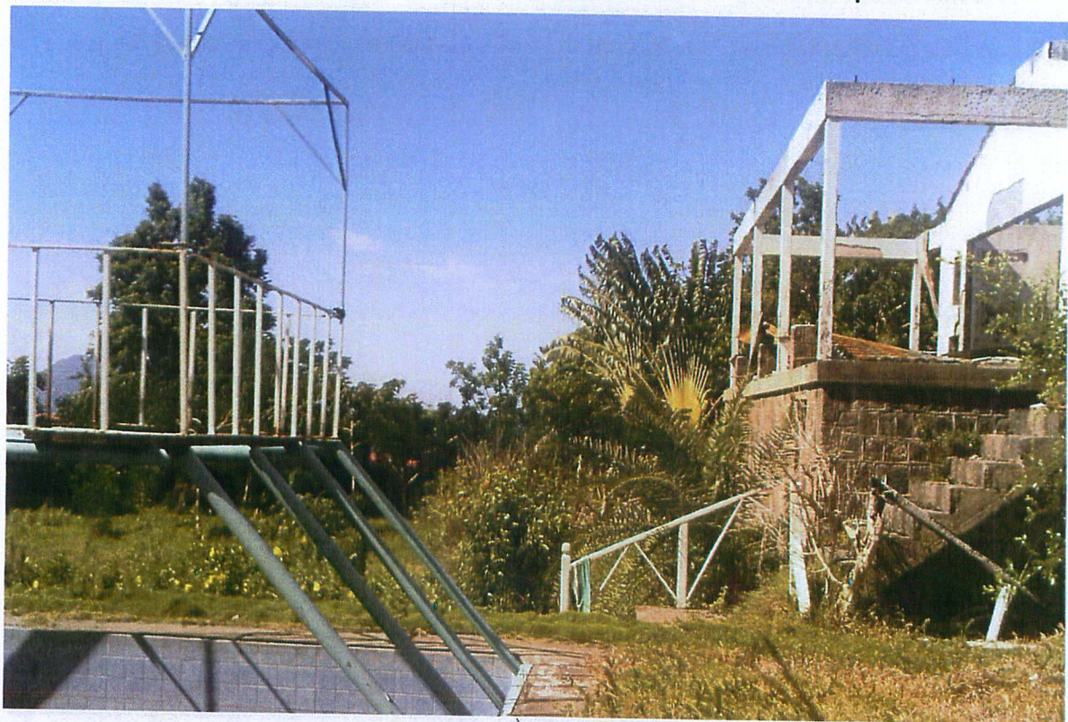
Photo P46 : Bandstand over swimming pool and entrance to outer restaurant.