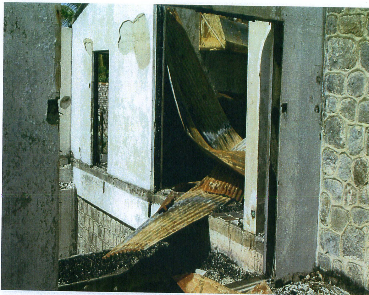
Photo P51 : View into Library, and Buffet Area, from main Dining Room.