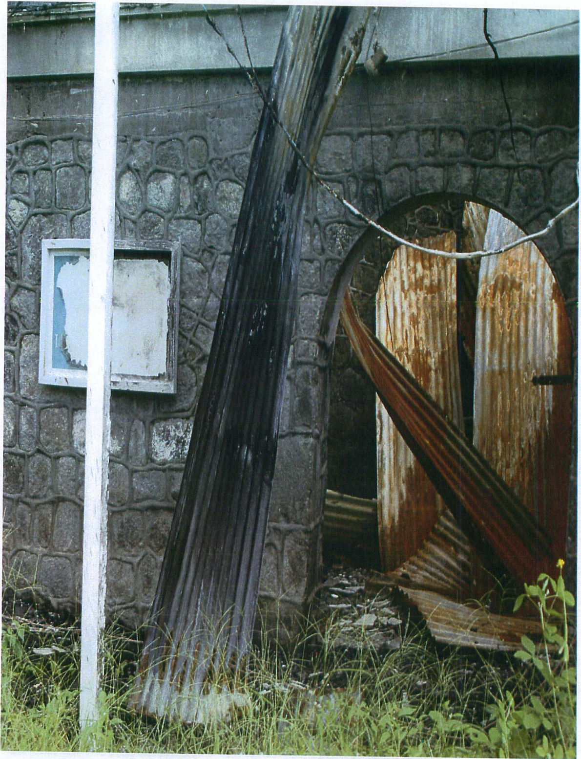
Photo P42 : Hotel Reception :- Welcome to Rawlins Plantation Inn !